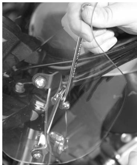
Figure 5 Photo, taken with clear shield on an XL