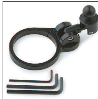
Z6465 Fork Tube Mount; Black Z6466 Fork Tube Mount; Silver Mounts onto the 55mm fork tube of the S1000R and S1000RR. Easily installed by sliding the clamp over the fork tube that protrudes from the top fork brace and tightening the tension screw. Can be mounted on either left or right side.