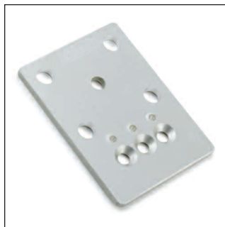
Small GPS/XM Top Plate Z6041 Black Z6042 Silver Z6043 Chrome

For mounting devices with the 4-hole AMPS pattern. Uses rubber bushings to hold devices securely and to isolate vibration. Works with Garmin®, Tom Tom® and RAM-Mount GPS cradles.