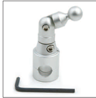
Z6408 GS Fairing Mount Mounts onto the upper windscreen support bracket of the R1200 GS Adventure windscreen, or the same position on ZTechnik's Z2422 or Z2423 VStream® Windscreen for the R1150 GS Adventure.