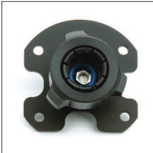
Garmin® Zumo™ Top Plate Z6442 Black Z6443 Silver Z6444 Chrome Accessory plate required for mounting a Garmin® Zumo™ to any 4th Generation ZTechnik Accessory Mount.