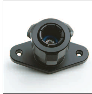
Z6434 RAM Cradle Adapter Two-hole diamond shaped adapter that allow any RAM cradle to attach to any 4th Generation ZTechnik Accessory Mount.