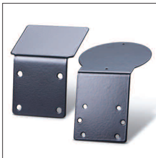
Z6053 XM Antenna Bracket Z6054 GPS/XM Antenna Bracket

For mounting devices with the 4-hole AMPS pattern. Uses rubber bushings to hold devices securely and to isolate vibration. Works with Garmin®, Tom Tom® and RAM-Mount GPS cradles.