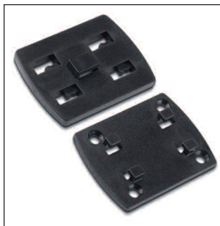
Z6059 Adapter; 4-Square Pin to Single Pin Male

Z6053 provides a magnetic mounting platform for satellite radio antennas. Mounts between Top Plate and attached device. Z6054 mounts your Garmin® antenna. Use fasteners supplied by Garmin to secure antenna.