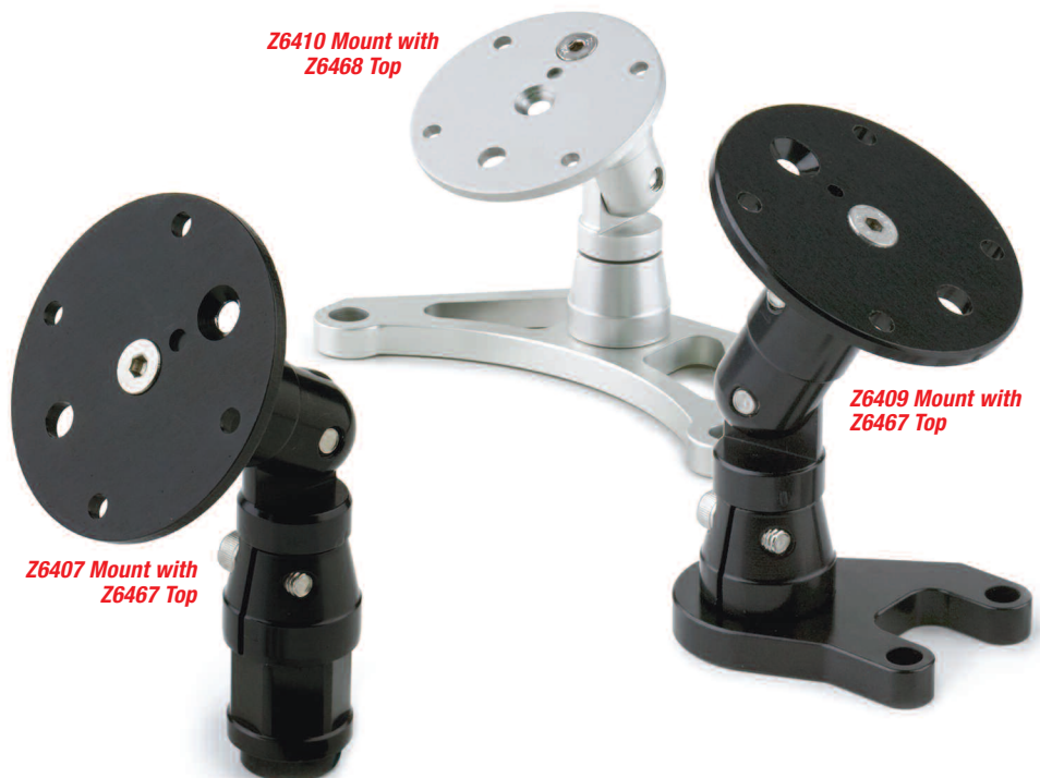
Z6410 Mount with Z6468 Top