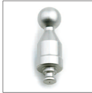
Accessory Mount Replacement Shaft Z6419 Black Z6420 Silver Z6421 Chrome 2-inch straight shaft for 4th Generation ZTechnik Accessory Mounts.