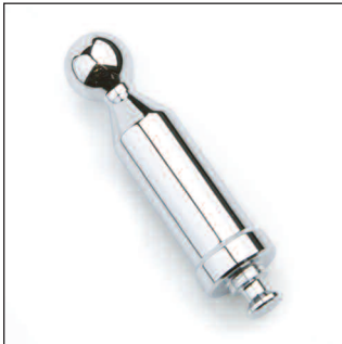
Accessory Mount Replacement Shaft Z6425 Black Z6426 Silver Z6427 Chrome 3-inch straight shaft for 4th Generation ZTechnik Accessory Mounts.