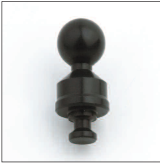
Accessory Mount Replacement Shaft Z6414 Black Z6415 Silver Z6440 Chrome 1-inch straight shaft for 4th Generation ZTechnik Accessory Mounts.