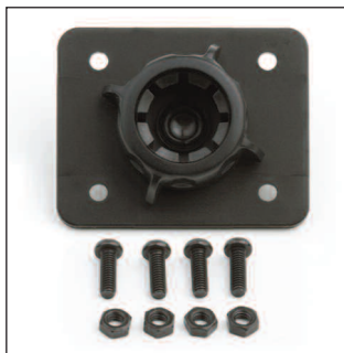
Z6430 Multi-Use Rectangular Top Plate

Radar Detector Accessory Top Plate with anti-slip pads and safety strap and 4th Generation 17mm ball socket adapter.