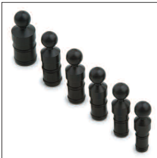
Z6405 BMW Steering Stem Mount Universal stem mount fits the steering stem nut of the 2010-14 S1000RR. Uses an O-ring shaft that gets progressively tighter as it is installed. Mounts devices center of the top triple clamp. Includes O-ring posts in 13mm, 16mm, 17mm, 18mm, 19mm and 24mm.