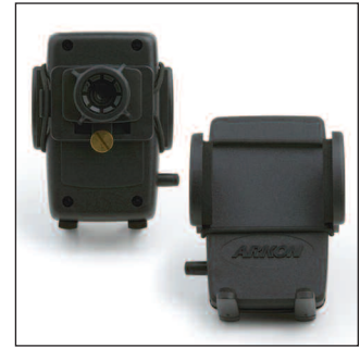
Z6435 Large Device Holder Secure holder for large cell phone or other devices. Features a safety strap and Dual-T adapter.