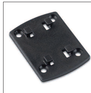
Z6060 Adapter; 4-Screw AMPS to 4-Square Pin Male

Converts 4-hole AMPS pattern on ZTechnik Accessory Mount Top Plates to single pin male mounting. Allows single slot accessories to be mounted onto ZTechnik top plates.