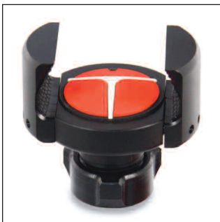
Z6476 TechGripper TechGripper's spring-loaded, soft rubber jaws will hold any device at any angle. Grabs hold of your device and won't let go, yet releasing it is effortless!