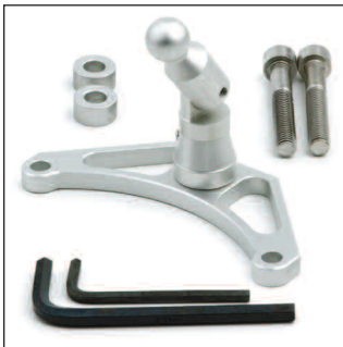
Z6410 R-RT Center Mount Z6411 K-GT Center Mount The Z6410 Center Mount fits 1994-13 R1100RT, R1150RT and R1200RT. Z6411 Center Mount fits 2006-10 K1200/1300GT.