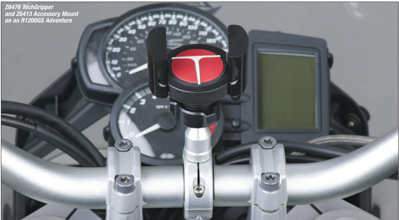
Z6476 TechGripper and Z6413 Accessory Mount on an R1200GS Adventure