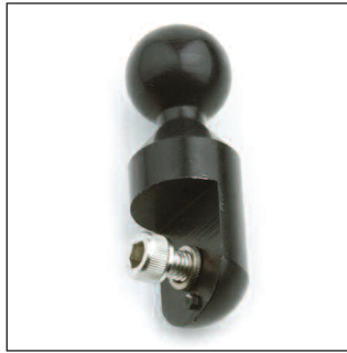
Accessory Mount Replacement Shaft Z6416 Black Z6417 Silver Z6418 Chrome 2-inch pivoting shaft for 4th Generation ZTechnik Accessory Mounts.