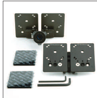
Dual Top Plate Z6448 Black Z6449 Chrome Mount two devices to the same mount! Dual 4-hole AMPS pattern 3.0" x 2.25" plates swivel independently.