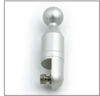
Accessory Mount Replacement Shaft Z6422 Black Z6423 Silver Z6424 Chrome 3-inch pivoting shaft for 4th Generation ZTechnik Accessory Mounts.