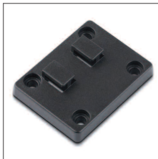
Z6061 Adapter; 4-Screw AMPS to Dual T Pin (Male)

Converts 4-hole AMPS pattern on ZTechnik Accessory Mount Top Plates to 4-square pins. Allows 4-square slot accessories to be mounted onto ZTechnik top plates.