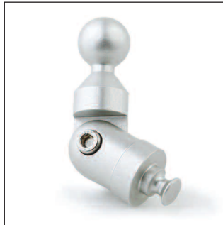
Accessory Mount Replacement Shaft Z6459 Black Z6460 Silver Z6461 Chrome 1-inch shaft with 1-inch pivoting arm for 4th Generation ZTechnik Accessory Mounts.