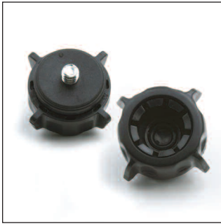
Z6432 Universal Camera Mount Universal camera mounting adapter for 4th Generation 17mm ball shaft. Fits universal tripod socket on most still and video cameras.