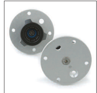
Round Top Plate Z6467 Black Z6468 Silver Z6469 Chrome Round 2.25" top plate with 4-hole AMPS pattern for any 4th Generation Accessory Mount.