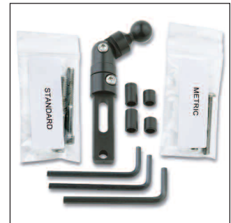
Z6475 BMW Control Mount BMW Control Mount fits onto the handlebar control pinch bolts (clutch or brake side). Fits later-model BMW control mounts having two horizontal pinch bolts facing the rear of the mount. Includes longer stainless steel bolts and spacers.