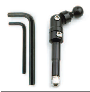
Z6406 BMW Mirror Mount BMW Mirror Mount fits into the unused mirror holes on the left or right side of the K1200GT, K1300GT, K1200LT and 2005-13 R1200RT.