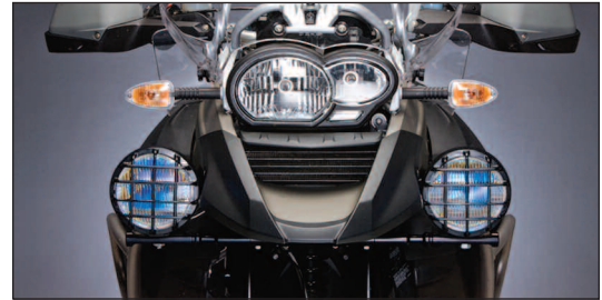
Your auxiliary lights can be mounted on top of the Z6024 Light Bar Kit, or suspended from underneath (lights not included).

Finished in anodized black, with stainless steel fasteners and complete installation instructions.