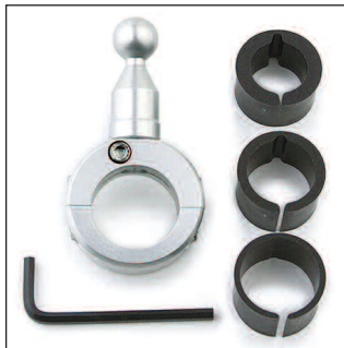
Z6412 Handlebar Mount; Black Z6413 Handlebar Mount; Silver Z6474 Handlebar Mount; Chrome Basic Handlebar Mount Kit fits all tubular handlebars from 7/8" (22mm) to 1-1/4" (32mm). Adapters are included.