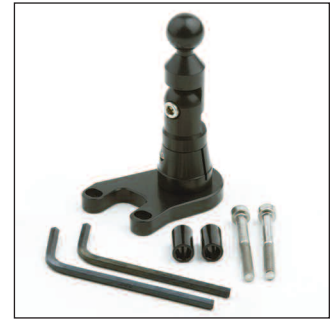
Z6409 BMW Control Mount BMW Control Mount fits onto the handlebar control pinch bolts (clutch or brake side). Fits BMW control mounts having two vertical pinch bolts facing the top of the mount. Note: Fits K1600GT clutch side only.