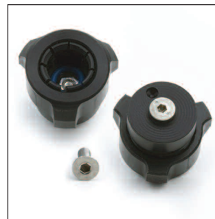
Z6431 Universal 17mm Ball Adapter

Multi-Use Rectangular Accessory Top Plate with 4-hole AMPS pattern pre-drilled. Top plate is 2.25" (57.15mm) x 1.87" (47.5mm).