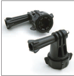
Z6433 GoPro™ Adapter ZAdapts the GoPro cameras to the 4th Generation 17mm ball shaft.