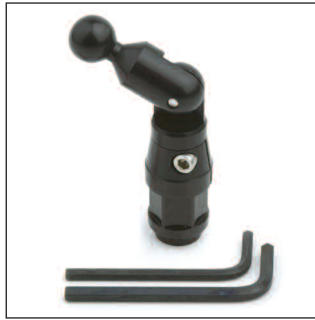
Z6407 BMW Fork Cap Mount Fork Cap Mount systems mount onto the fork tube oil filler bolts found on many late model BMW motorcycles.