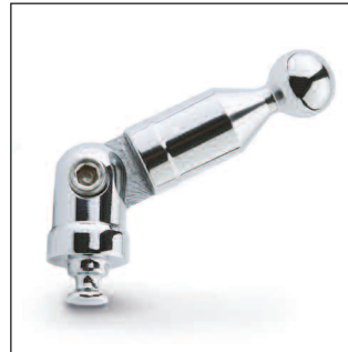
Accessory Mount Replacement Shaft Z6462 Black Z6463 Silver Z6464 Chrome 1-inch shaft with 2-inch pivoting arm for 4th Generation ZTechnik Accessory Mounts.

NOTE: These Replacement Shafts can upgrade most 3rd Generation Accessory Mounts to accept 4th Generation ball socket top plates, adapters and accessories.