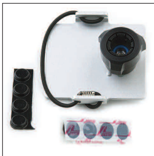
Radar Detector Top Plate Kit Z6428 Black Z6441 Silver Z6429 Chrome

Converts 4-hole AMPS pattern on ZTechnik Accessory Mount Top Plates to Dual T pins. Allows Dual T slot accessories to be mounted onto ZTechnik top plates.