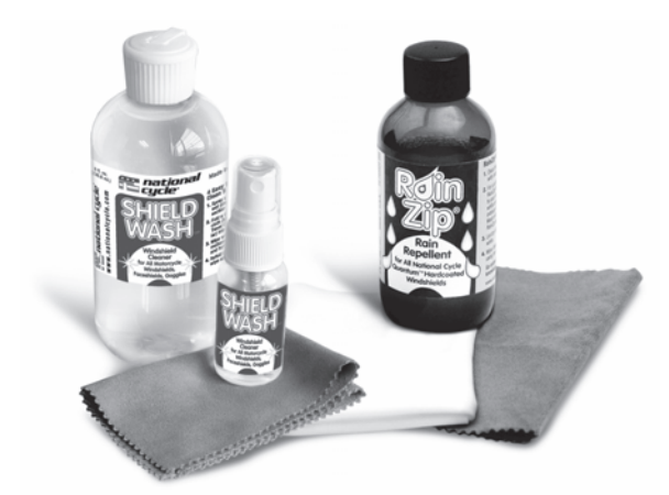
Ask for Shield Wash™ and RainZip® at your local dealer or visit www.nationalcvcle.com.