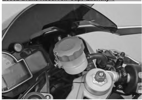
ZCap, Brake Reservoir Replacement Cap, Machined Aluminum Fits: S1000 RR