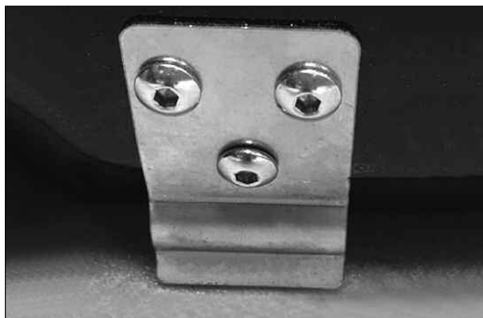
OUTSIDE of Saddlebag