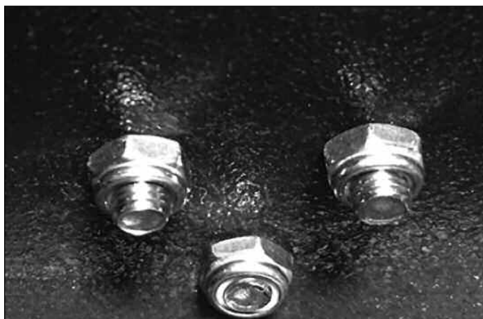
INSIDE of Saddlebag