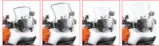
N20412 N20413 N20414 N20415

Visit your local dealer or browse our web site for the VStream Windscreen that will make your bike perfect and improve your riding experience.