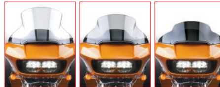
N20431 N20432 N20433