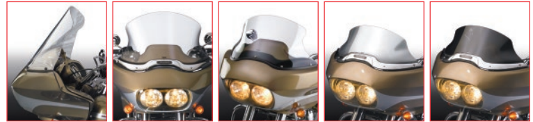
N20421 N20422 N20425 N20424 N20423