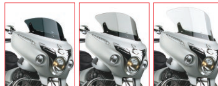
N20703 N20704 N20705

All FLTR VStream® Windscreens include metal compression limiters that spread the load for long life and durability.