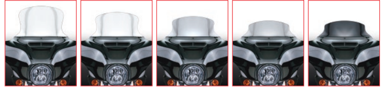
N20407 N20408 N20409 N20410 N20411

All Pan America Windscreens include hardcoated polycarbonate replacement Side Deflectors.