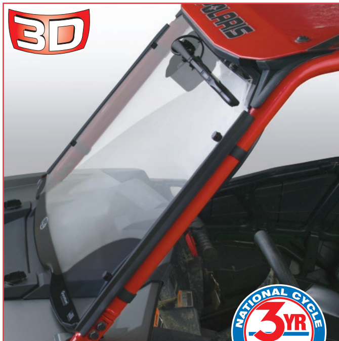
All National Cycle SxS UTV windshields come with our factory 3-Year Unbreakable Warranty. Complete warranty details available online.