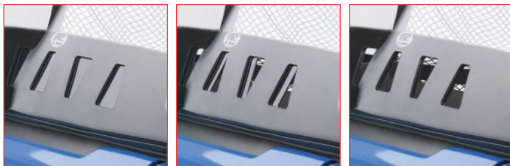
National Cycle's 3D-formed N30002 windshield for the Honda® Pioneer features an easily adjustable air vent.

National Cycle's 3D SxS windshields are now available for Polaris® RZR and Honda® Pioneer 500/700. All future SxS UTV windshields will utilize our new 3D forming technology as well.