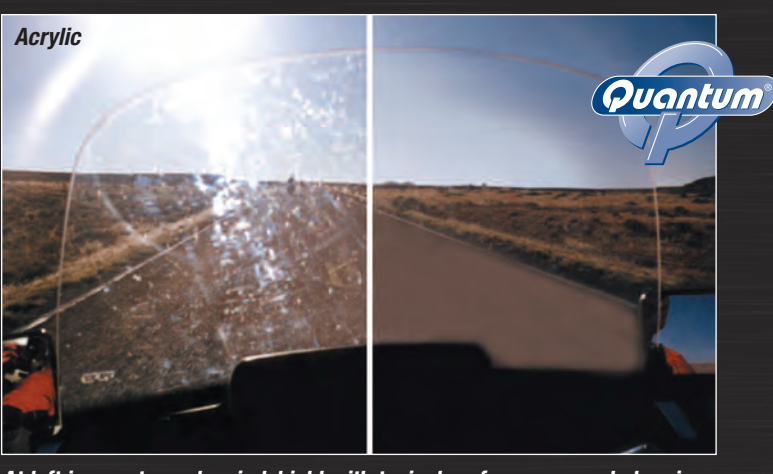
At left is a motorcycle windshield with typical surface wear and abrasions. This is not what you want in front of you when facing oncoming traffic!

Think about riding into the sun or at night and not having to look through the glare of fine scratches that eventually show up on your screens. Quantum coating gives your windshield much better optical definition and clarity , and your windshield will stay that way a lot longer.