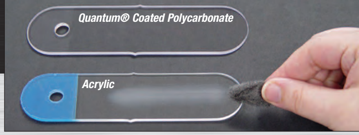
We use a steel wool scratch test to demonstrate the abrasion resistance of Quantum® coated polycarbonate (top) against acrylic (bottom).