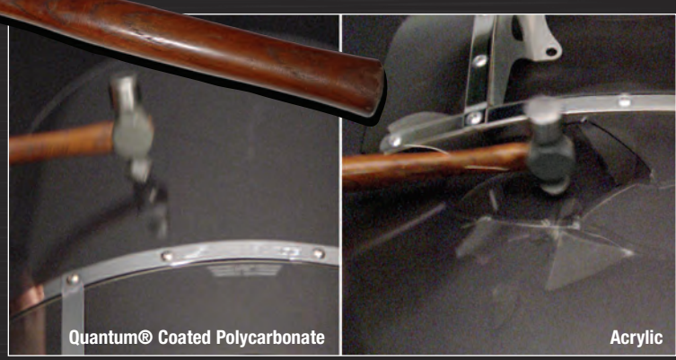
We applied a ball peen hammer at full force to one of our polycarbonate shields (left) and to a competitor's acrylic shield (right). We're professionals – don't try this at home!