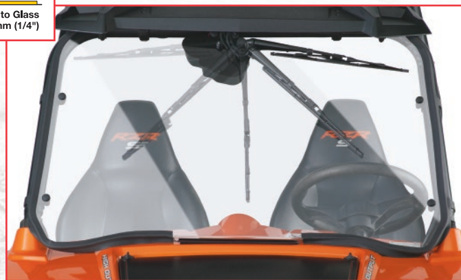
Shown with optional Wash'n'Wipe™ Kit installed.

All windshields are pre-drilled for adding an optional Wash'n'Wipe™ Kit.