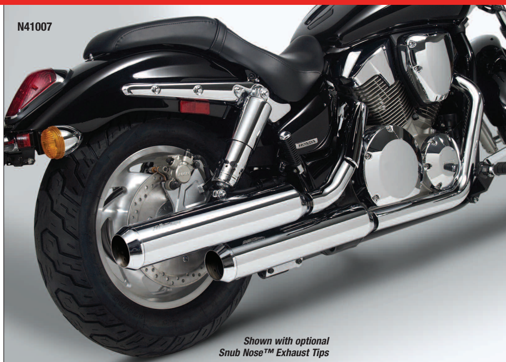
Shown with optional Snub Nose™ Exhaust Tips