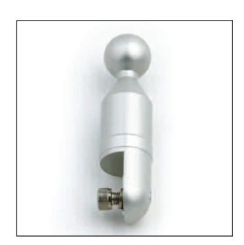
Accessory Mount Replacement Shaft Z6422 Black Z6423 Silver Z6424 Chrome

2-inch straight shaft for 4th Generation ZTechnik Accessory Mounts.