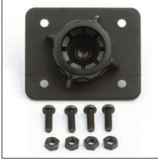
Z6430 Multi-Use Rectangular Top Plate

Radar Detector Accessory Top Plate with antislip pads and safety strap and 4th Generation 17mm ball socket adapter.