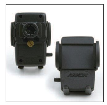
Z6435 Large Device Holder Secure holder for large cell phone or other devices. Features a safety strap and Dual-T adapter.