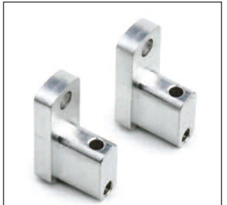
Z6439 Light Mount Kit

These easily installed brackets mount to the headlight adjuster bolts on 2013-16 F700GS, 2008-16 F800GS and 2008-12 F650GS Twin.