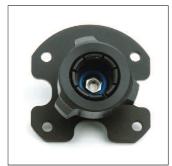
Garmin® Zumo™ Top Plate