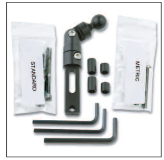
Z6475 BMW Control Mount BMW Control Mount fits onto the handlebar control pinch bolts (clutch or brake side). Fits later-model BMW control mounts having two horizontal pinch bolts facing the rear of the mount. Includes longer stainless steel bolts and spacers.