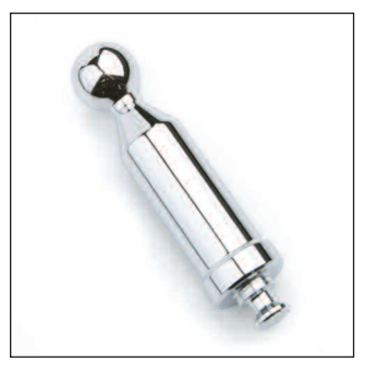
Accessory Mount Replacement Shaft Z6425 Black Z6426 Silver

3-inch pivoting shaft for 4th Generation ZTechnik Accessory Mounts.