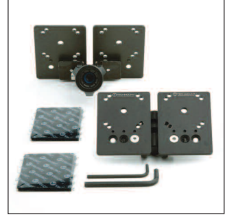
Dual Top Plate

Wide Top Plate for mounting accessories such as a large GPS or radar detector. Mounts to any 4th Generation Accessory Mount.