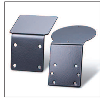
Z6053 XM Antenna Bracket Z6054 GPS/XM Antenna Bracket

For mounting devices with the 4-hole AMPS pattern. Uses rubber bushings to hold devices securely and to isolate vibration. Works with Garmin®, Tom Tom® and RAM-Mount GPS