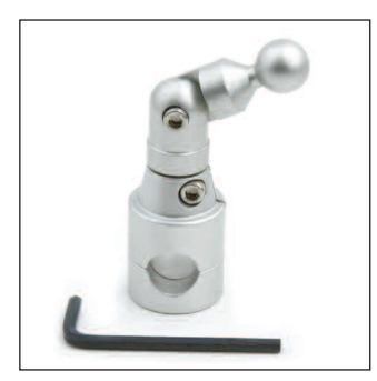
Z6408 GS Fairing Mount Mounts onto the upper windscreen support bracket of the R1200 GS Adventure windscreen, or the same position on ZTechnik's Z2422 or Z2423 VStream® Windscreen for the R1150 GS Adventure.