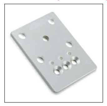
Small GPS/XM Top Plate