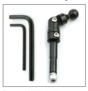
Z6406 BMW Mirror Mount BMW Mirror Mount fits into the unused mirror holes on the left or right side of the K1200GT, K1300GT, K1200LT and 2005-13 R1200RT.