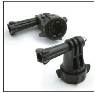
Z6433 GoPro™ Adapter ZAdapts the GoPro cameras to the 4th Generation 17mm ball shaft.