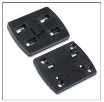
Z6059 Adapter; 4-Square Pin to Single Pin Male

Z6053 provides a magnetic mounting platform for satellite radio antennas. Mounts between Top Plate and attached device. Z6054 mounts your Garmin® antenna. Use fasteners supplied by Garmin to secure antenna.