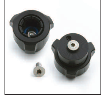
Z6431 Universal 17mm Ball Adapter

Multi-Use Rectangular Accessory Top Plate with 4-hole AMPS pattern pre-drilled. Top plate is 2.25" (57.15mm) x 1.87" (47.5mm).