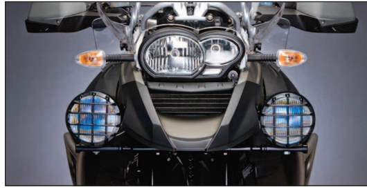
Your auxiliary lights can be mounted on top of the Z6024 Light Bar Kit, or suspended from underneath (lights not included).

Pre-drilled light mounting brackets can be rotated 360 degrees, offering complete versatility for placement and positioning of lights (lights not included).