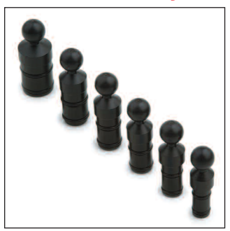
BMW Steering Stem Mount Universal stem mount fits the steering stem nut of the 2010-14 S1000RR. Uses an O-ring shaft that gets progressively tighter as it is installed. Mounts devices center of the top triple clamp. Includes 0-ring posts in 13mm, 16mm, 17mm, 18mm, 19mm and 24mm.