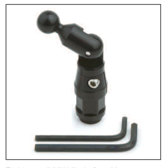
Z6407 BMW Fork Cap Mount Fork Cap Mount systems mount onto the fork tube oil filler bolts found on many late model BMW motorcycles.