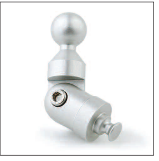
Accessory Mount Replacement Shaft Z6459 Black Z6460 Silver Z6461 Chrome

1-inch shaft with 1-inch pivoting arm for 4th Generation ZTechnik Accessory Mounts.