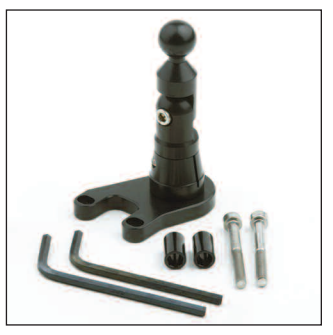
Z6409 BMW Control Mount BMW Control Mount fits onto the handlebar control pinch bolts (clutch or brake side). Fits BMW control mounts having two vertical pinch bolts facing the top of the mount. Note: Fits K1600GT clutch side only.