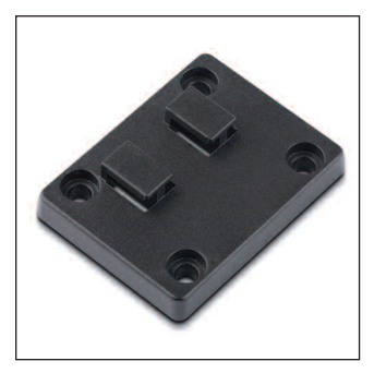
Z6061 Adapter; 4-Screw AMPS to Dual T Pin (Male)

Converts 4-hole AMPS pattern on ZTechnik Accessory Mount Top Plates to 4-square pins. Allows 4-square slot accessories to be mounted onto ZTechnik top plates.