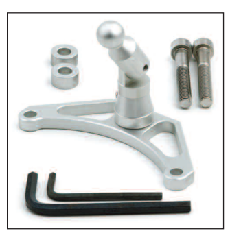
Z6410 R-RT Center Mount K-GT Center Mount The Z6410 Center Mount fits 1994-13 R1100RT, R1150RT and R1200RT. Z6411 Center Mount fits 2006-10 K1200/1300GT.