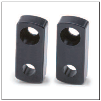
Light Mount Kit Z6026

Finished in anodized black, with stainless steel fasteners and complete installation instructions.