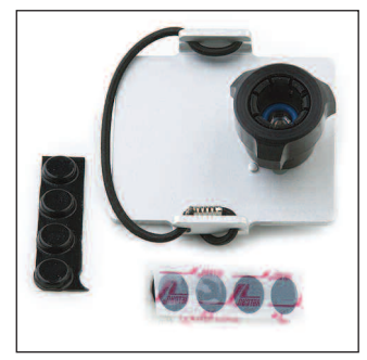
Radar Detector Top Plate Kit Z6428

Converts 4-hole AMPS pattern on ZTechnik Accessory Mount Top Plates to Dual T pins. Allows Dual T slot accessories to be mounted onto ZTechnik top plates.