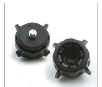
Z6432 Universal Camera Mount Universal camera mounting adapter for 4th Generation 17mm ball shaft. Fits universal tripod socket on most still and video cameras.