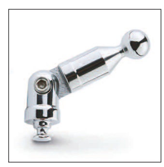
Accessory Mount Replacement Shaft

1-inch shaft with 1-inch pivoting arm for 4th Generation ZTechnik Accessory Mounts.