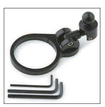
Z6465 Fork Tube Mount; Black Fork Tube Mount; Silver Mounts onto the 55mm fork tube of the S1000R and S1000RR. Easily installed by sliding the clamp over the fork tube that protrudes from the top fork brace and tightening the tension screw. Can be mounted on either left or right side.