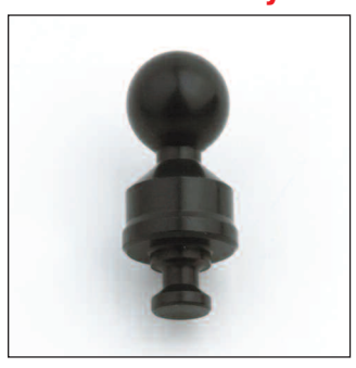
Accessory Mount Replacement Shaft Z6415 Silver Z6414 Black Z6440 Chrome

1-inch straight shaft for 4th Generation ZTechnik Accessory Mounts.