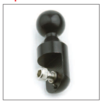
Accessory Mount Replacement Shaft Z6416 Black Z6417 Silver Z6418 Chrome

1-inch straight shaft for 4th Generation ZTechnik Accessory Mounts.