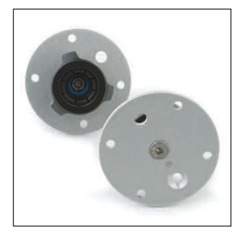
Round Top Plate

Mount two devices to the same mount! Dual 4-hole AMPS pattern 3.0" x 2.25" plates swivel independently.