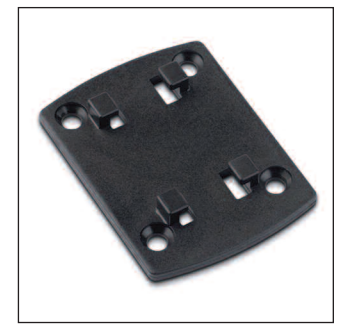
Z6060 Adapter; 4-Screw AMPS to 4-Square Pin Male

Converts 4-hole AMPS pattern on ZTechnik Accessory Mount Top Plates to single pin male mounting. Allows single slot accessories to be mounted onto ZTechnik top plates.