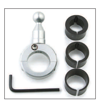
Z6412 Handlebar Mount; Black Z6474 Handlebar Mount; Silver Handlebar Mount; Chrome Basic Handlebar Mount Kit fits all tubular handlebars from 7/8" (22mm) to 1-1/4" (32mm). Adapters are included.